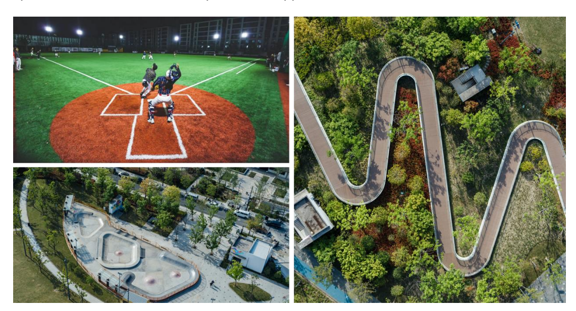
On the commercial front, Panlong Tiandi will create new business opportunities that will

With the opening of Shanghai Panlong Tiandi, Shui On has introduced a revolutionary new Urban Retreat concept which embodies its progressive philosophies on park and commercial community models. Through the combination of multiple characteristics such as history, humanity, nature and social interaction, Panlong Tiandi provides a reinvigorating space for residents and a new portfolio of opportunities for businesses.